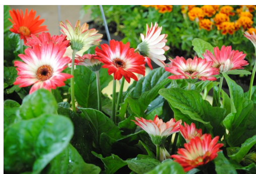
Beautiful Flowers Everywhere!