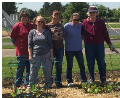
5/27 Planting Crew