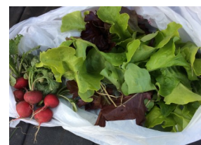
5/30 First Harvest