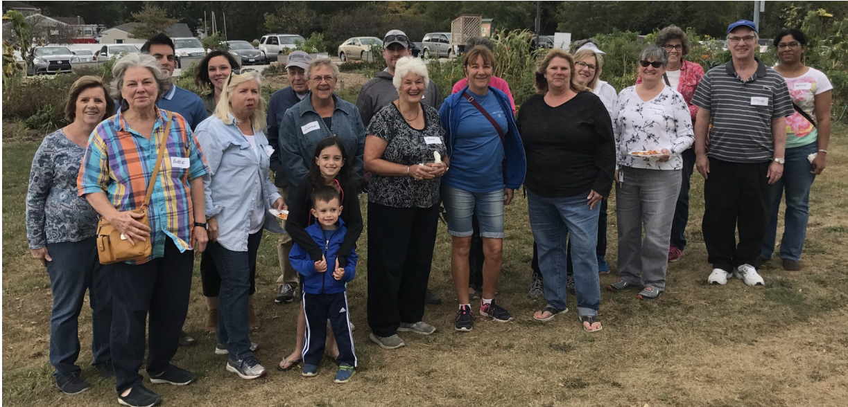
Community & Giving Gardeners, Master Gardeners, Itasca Park District Garden Club members, Bloomingdale Garden Club members, & families.