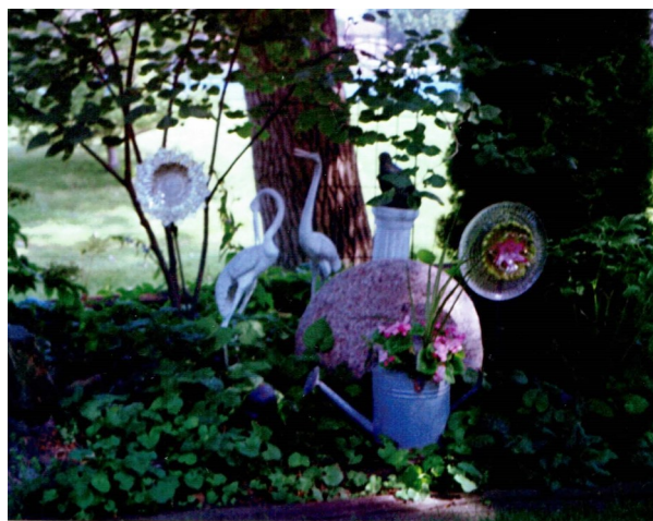
3rd Place—Carole Lockerbie