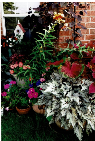
2nd Place—Joyce Basel