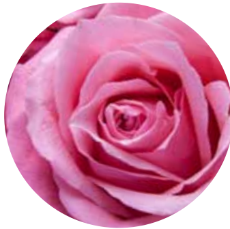
Pink Roses Express love and gratitude. (Red is for romance.)