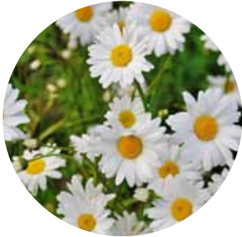
English Daisy A bright symbol of new beginnings