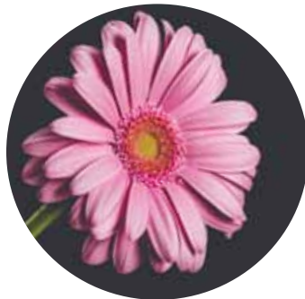
Gerbera Daisy Cheery stems send messages of happiness.