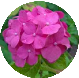
Hydrangea Shades of pink represent sincere love and devotion.