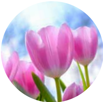
Tulips The pink petals symbolize enduring love for family.