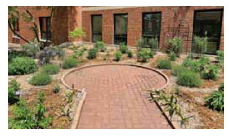
Dear Bloomingdale Garden Club,

We are so very, very grateful for all that you have done for us at DuPage Care Center. Our annual planting day which was held on May 20th was the first time most of us had been outside in 15 months! What we saw as we entered our Secret Garden were beautiful container gardens that you donated, the incredible new Pollinator Garden, and the touching Healing Garden Art Pole.