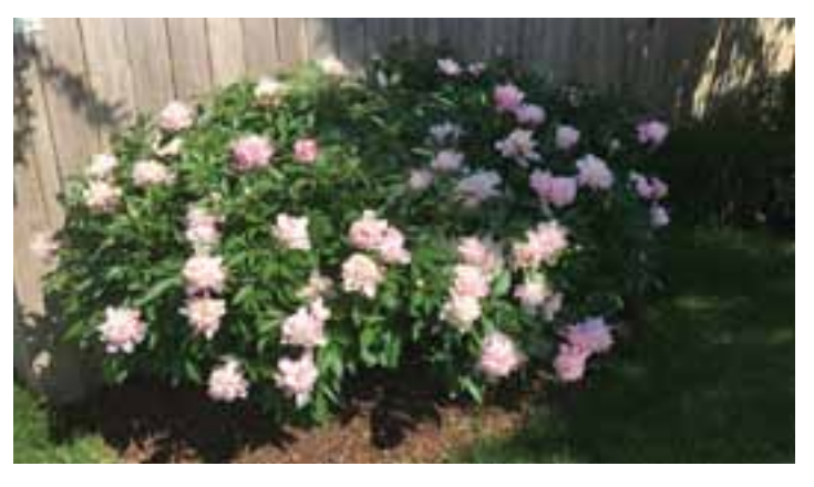
Jamie Schneck's grandmother's peonies still blooming since 1960.