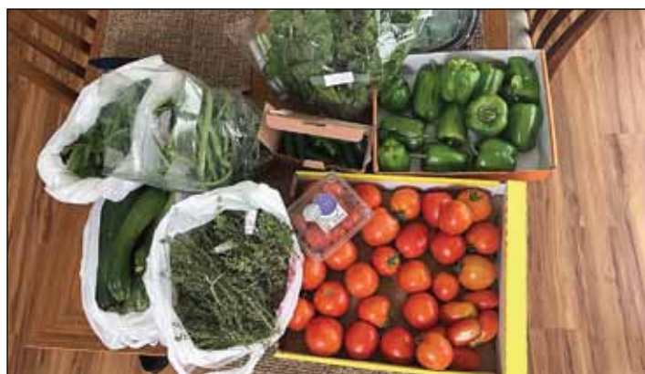
Harvest photos from the community garden.