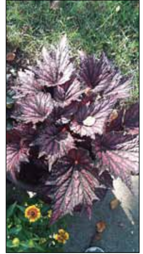
A few of my beautiful coleus, caladium and rex begonias in my pots.