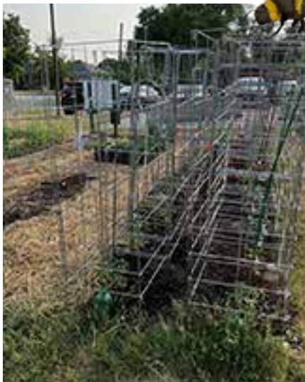
New tomato cages in the garden.

As things warmed up we have added transplants of basil, parsley, green and hot peppers, tomatillos, and tomatoes. Seeds for green beans, carrots, cucumbers, acorn and butternut winter squash, and zucchini have been sown. Flower seeds have been added to a section in the middle of the garden. At the time of writing, only the cucumber seeds have germinated. During this dry spell the committee has been watering several times each week. Rain gauges in the garden tell us that the hit and miss showers have mostly missed the garden.